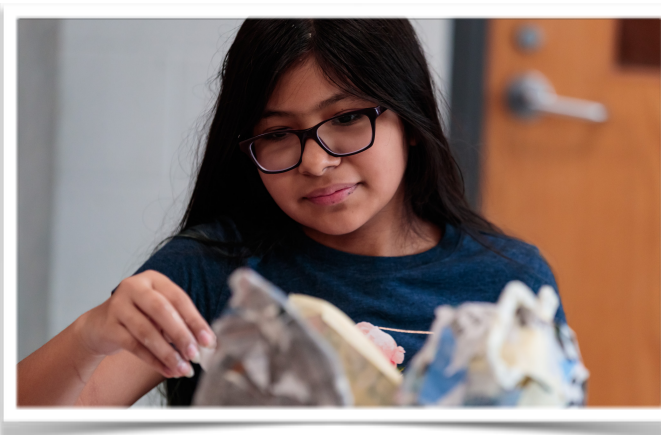
3d guild students work on paper