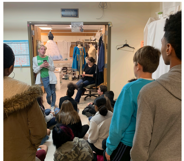
Guild students attend backstage tour at Raleigh Little Theatre

Fundraiser materials will be ready for student/parent pickup December 16, 2019 from 2:30 - 6:00 p.m.